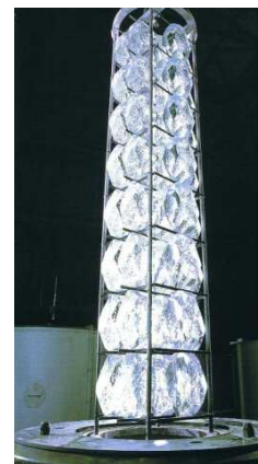
TEW-AGC Joint patent obtained